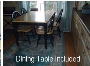
Dining Table Included