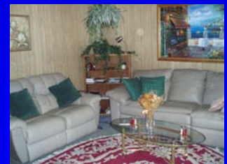
Couches & Glass Tables Included