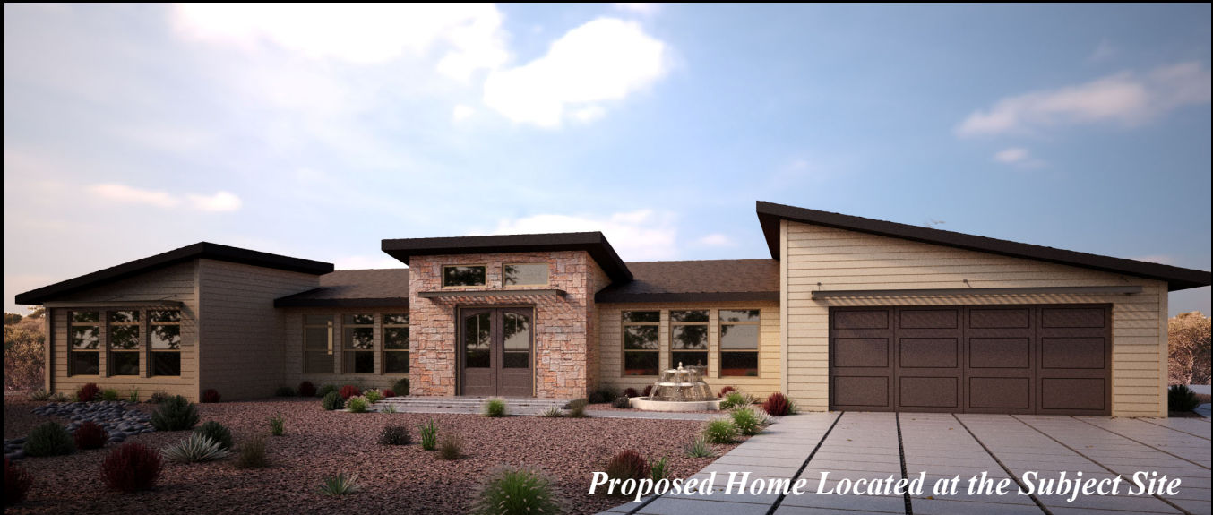
Proposed Home Located at the Subject Site